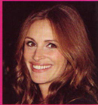
JULIA ROBERTS Fab at 40!