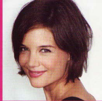
KATIE HOLMES Pregnancy Rumors