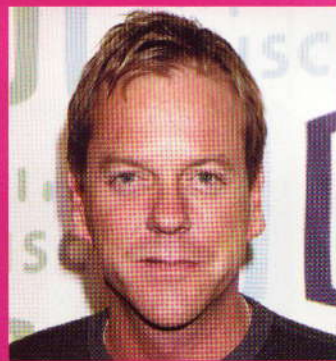
KIEFER SUTHERLAND'S Struggle with Alcohol