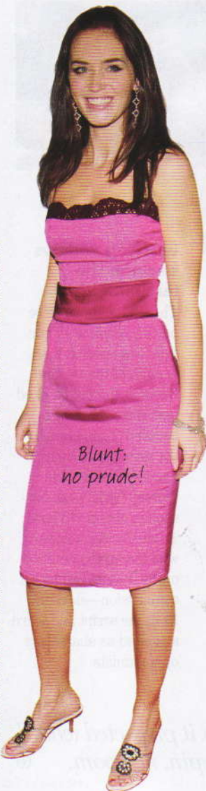
Blunt: no prude!